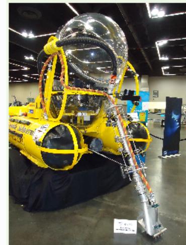
SEAmagine's SEAmobile submersible on display at the 2011 International Oil Spill