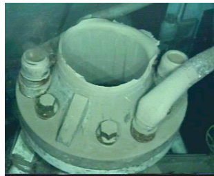
Top of Lower Marine Riser Package (LMRP) Where Joint No. 1 Had Been Connected