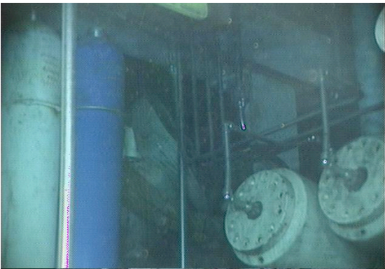
Riser Joint No. 1 Laying Against BOPs

3,000 feet of pipe was still attached to the drillship, and another 1,000 feet of riser was simply dangling--ready to fall on the BOPs. The top connector of the BOP was damaged, with one joint leaning against the BOP, dangerously close to the control lines (see photos below). Loss of well containment would result in more oil spilled in a week than occurred during the whole of the T/V Exxon's Valdez oil spill.