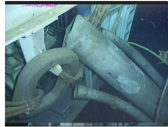
Close Up of Riser Joint No. 1